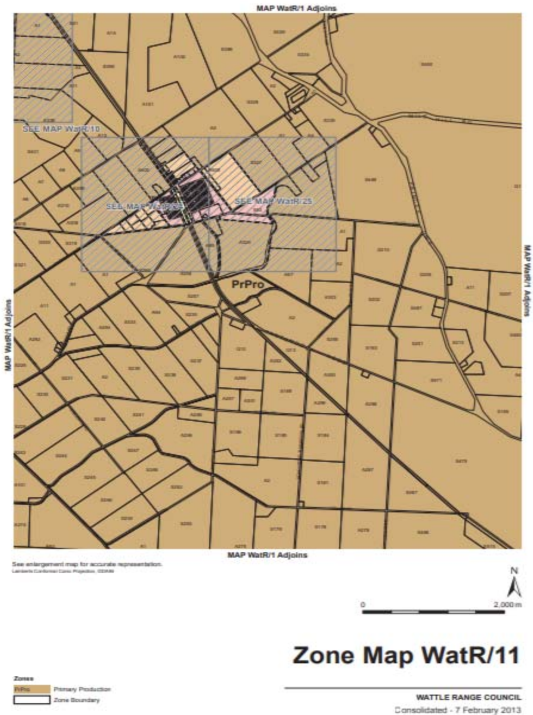
Zone Map for Tantanoola taken from the Wattle Range Council Development Plan