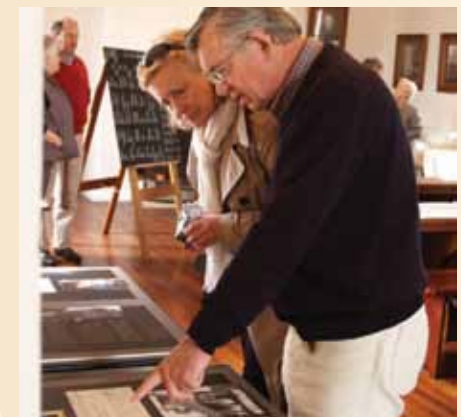
Mary MacKillop Interpretive Centre

Mary MacKillop shrine through the church to see the beautiful stained glass window of Mary.