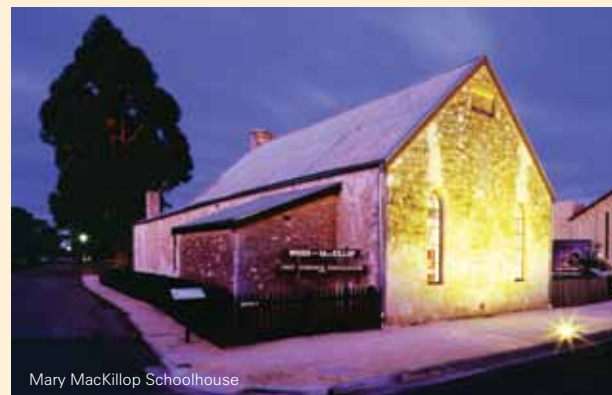
Mary MacKillop Schoolhouse