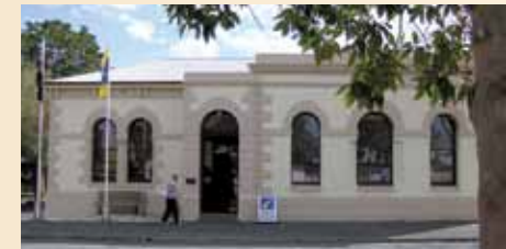
John Riddoch Centre

A visit to the John Riddoch Centre is an ideal place to start your journey. Make it your first stop to view the history of the district in the Local History Display and trace the history in the well resourced Research room, enjoy the John Shaw Neilson Acquisitive Art Prize Galler and collect your souvenirs and tourist information, including the 'Walk with History brochure'. This brochure traces the steps of 'Mary', the Mary MacKillop Memorial Park (the site of her first stable school), the Mary MacKillop Penola Centre and Woods MacKillop SchoolHouse and other sites. Open 7 days a week.