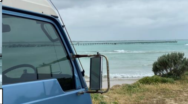
ABOVE: Surf was up in front of the Beachport jetty on the weekend