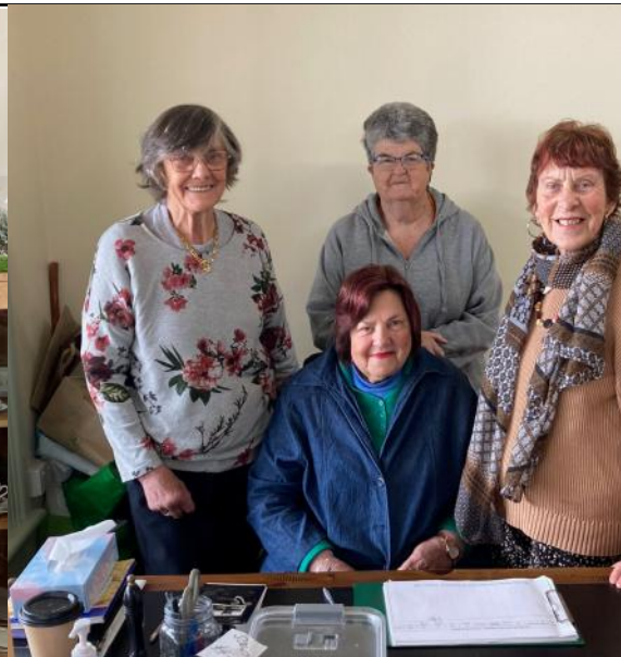
ABOVE & RIGHT: Some of the happy volunteers at the National Trust Beachport Museum.