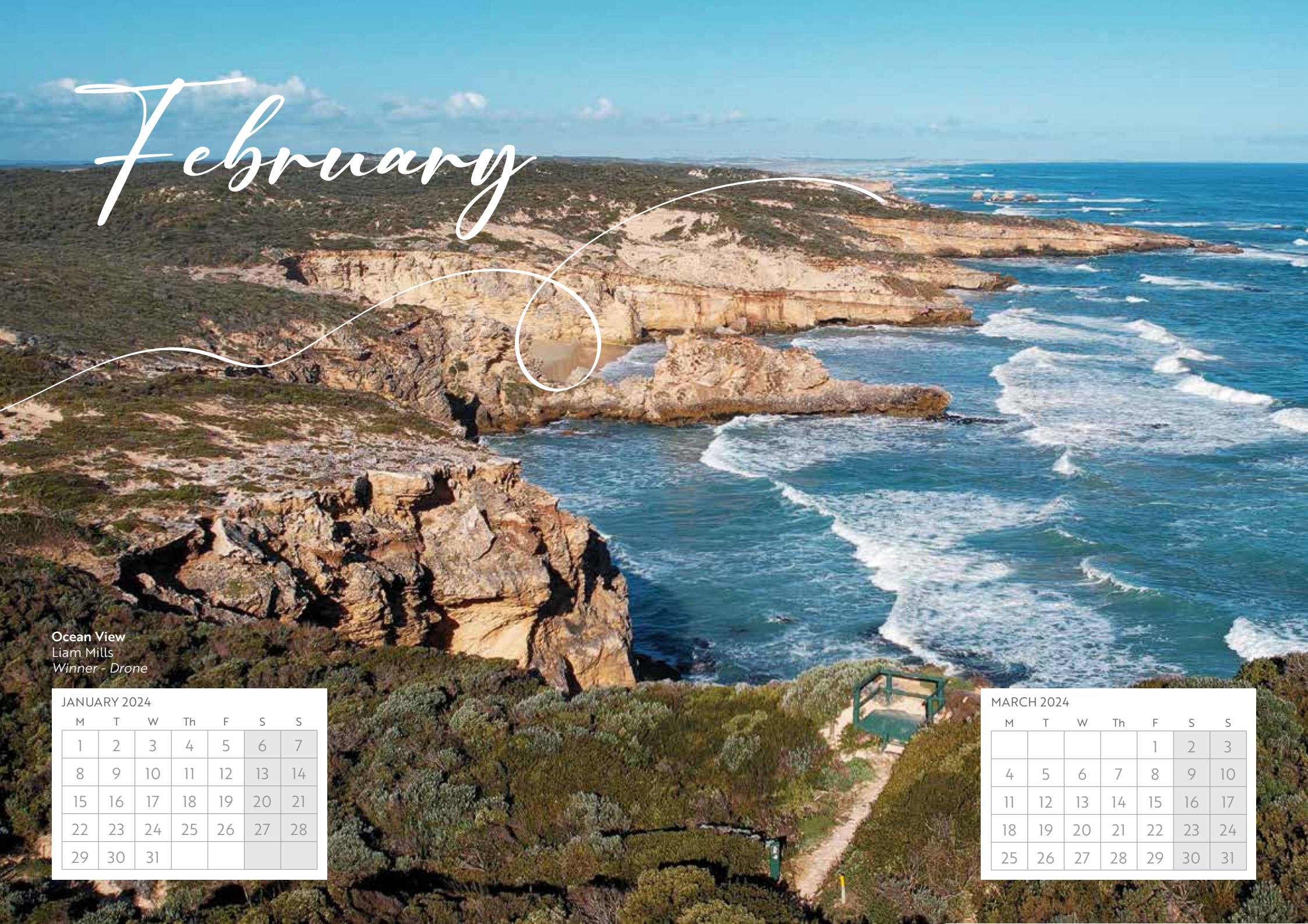
Ocean View Liam Mills Winner - Drone