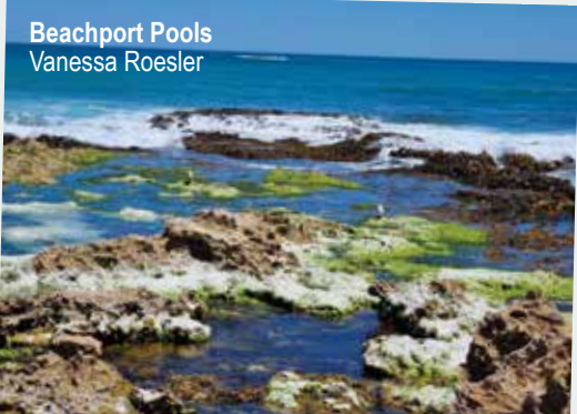
Beachport Pools Vanessa Roesler